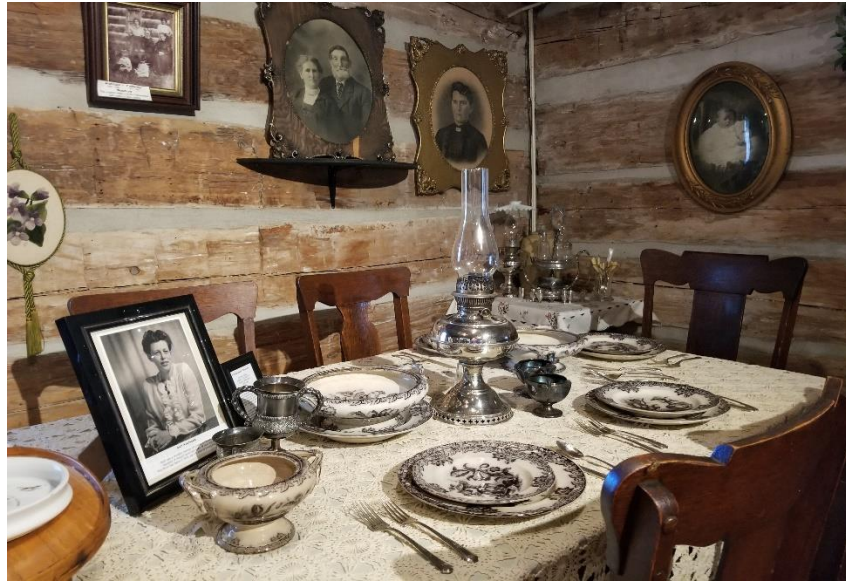
Summer 2020 table display in the Fireplace Room featuring mid 19 th century flow mulberry-black dinnerware donated by Ruth Woodworth. Ruth was one of the CCHM's founding members.