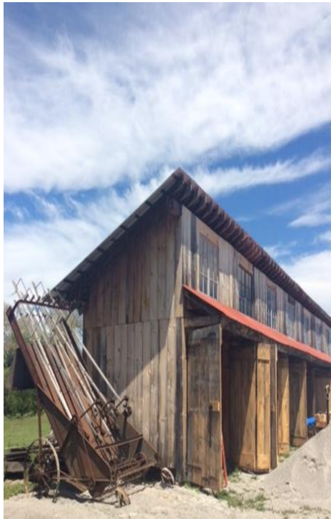
A new overhang for the pole barn