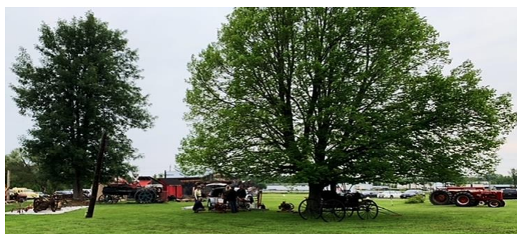
Ramara Historical Society & CCHM Vintage Vehicles