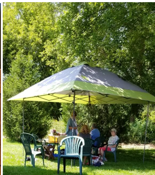
Socializing and working in a great locale