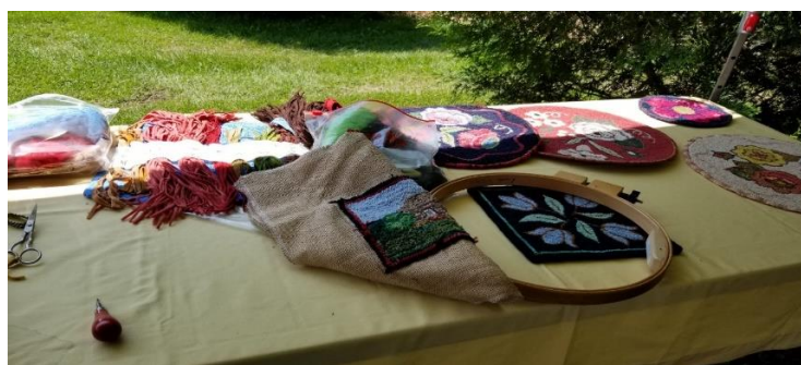
Completed and in-progress handwork